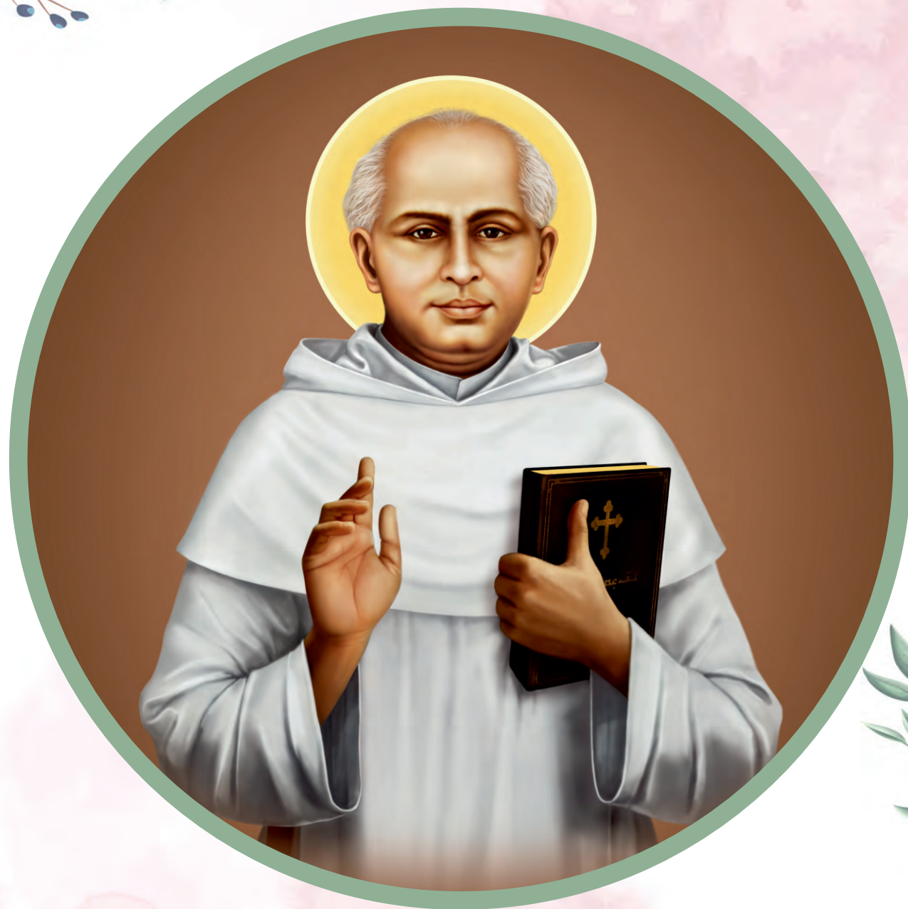
ST. KURIAKOSE ELIAS CHAVARA